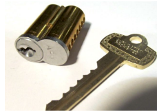
RESTRICTED KEY SYSTEM

LOCATION: PROVIDENCE, RI CATEGORY: LOCKSMITH HARDWARE/ CONSULTING DATES: 2014- ONGOING